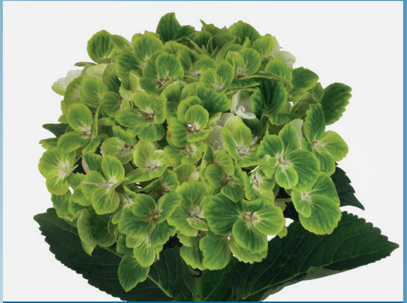
Magical Green Cloud