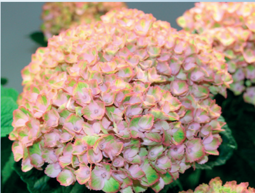
Magical Revolution XXL