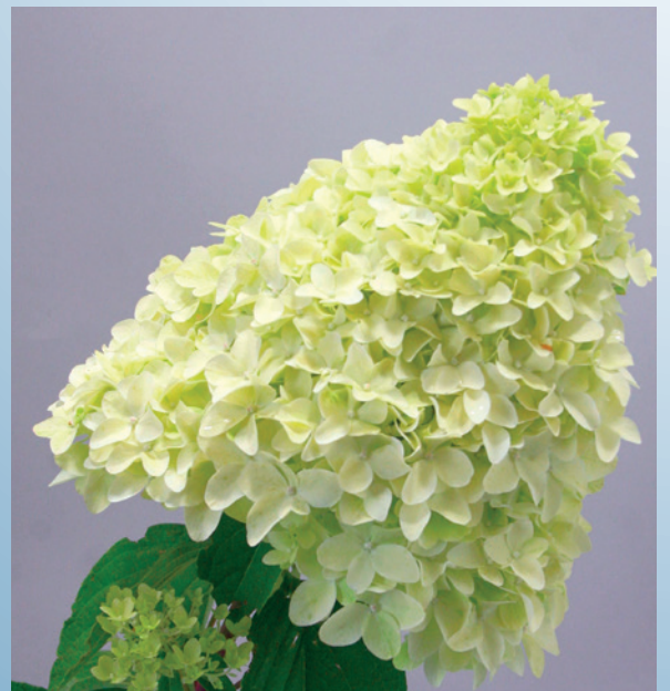
Hydrangea paniculata Magical Candle