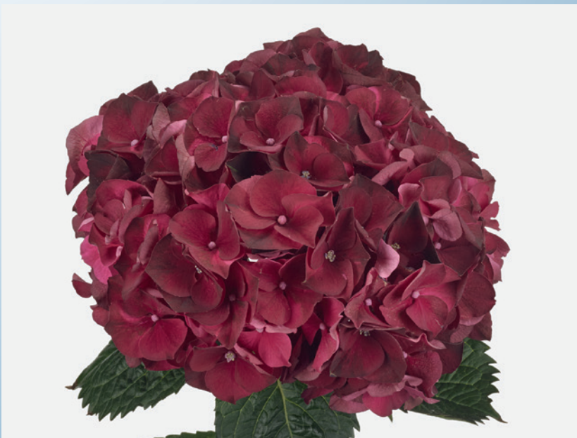
Magical Dark Ruby