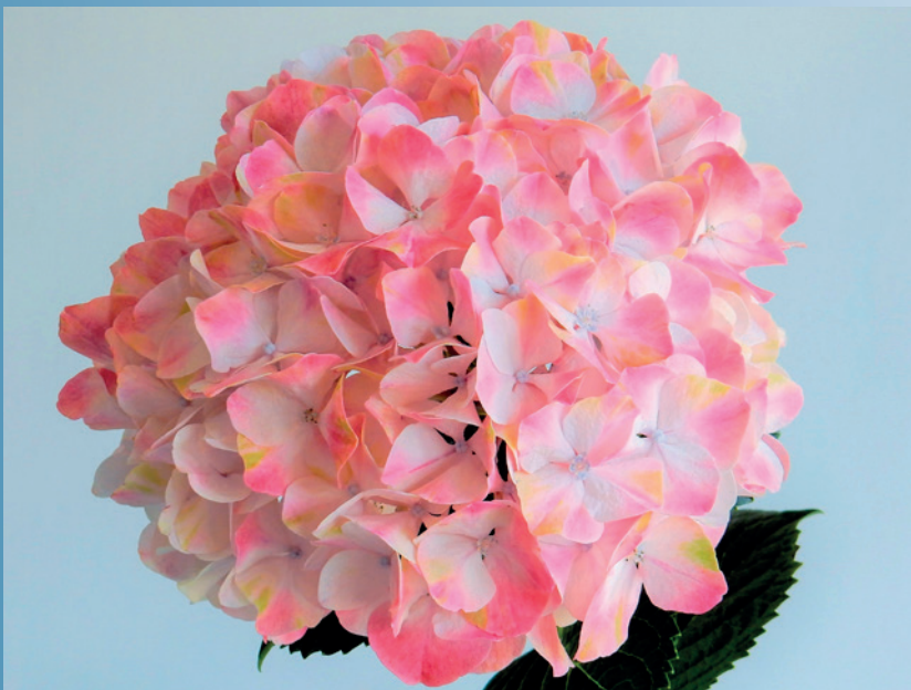
Magical Sweet Ruby