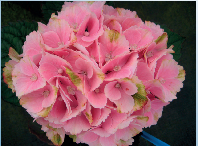
Magical Pink Cloud