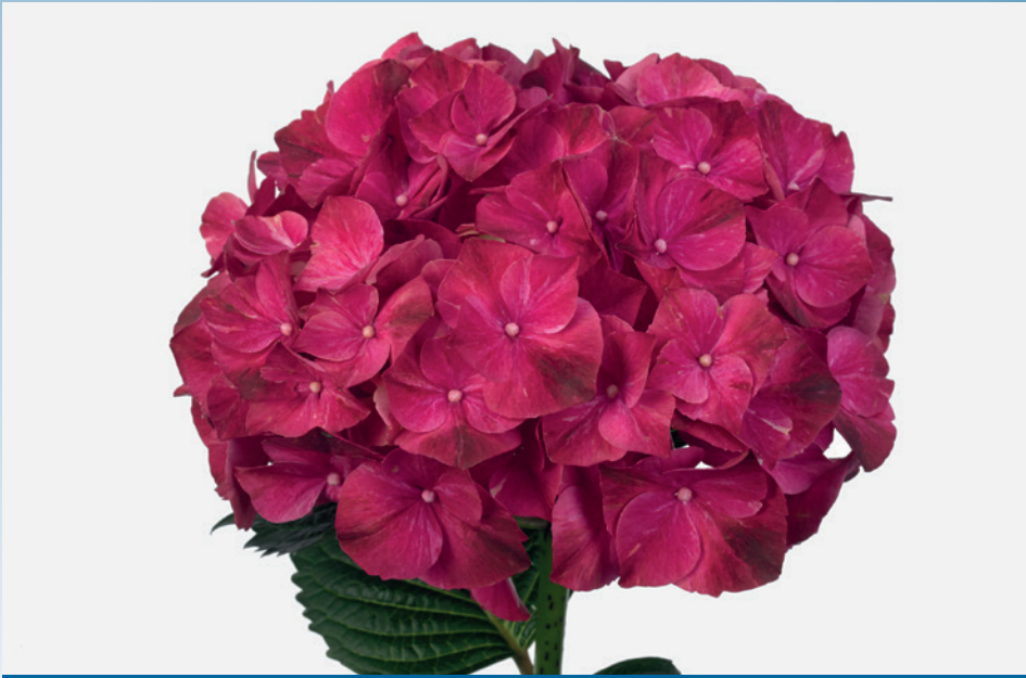
Magical Pink Ruby